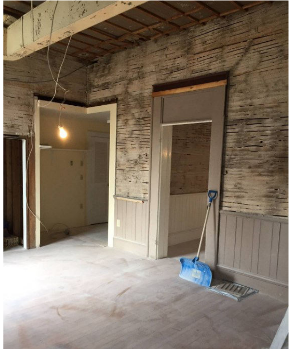
Down to the bare bones