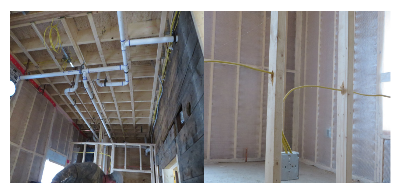
Piping and wiring in the new addition