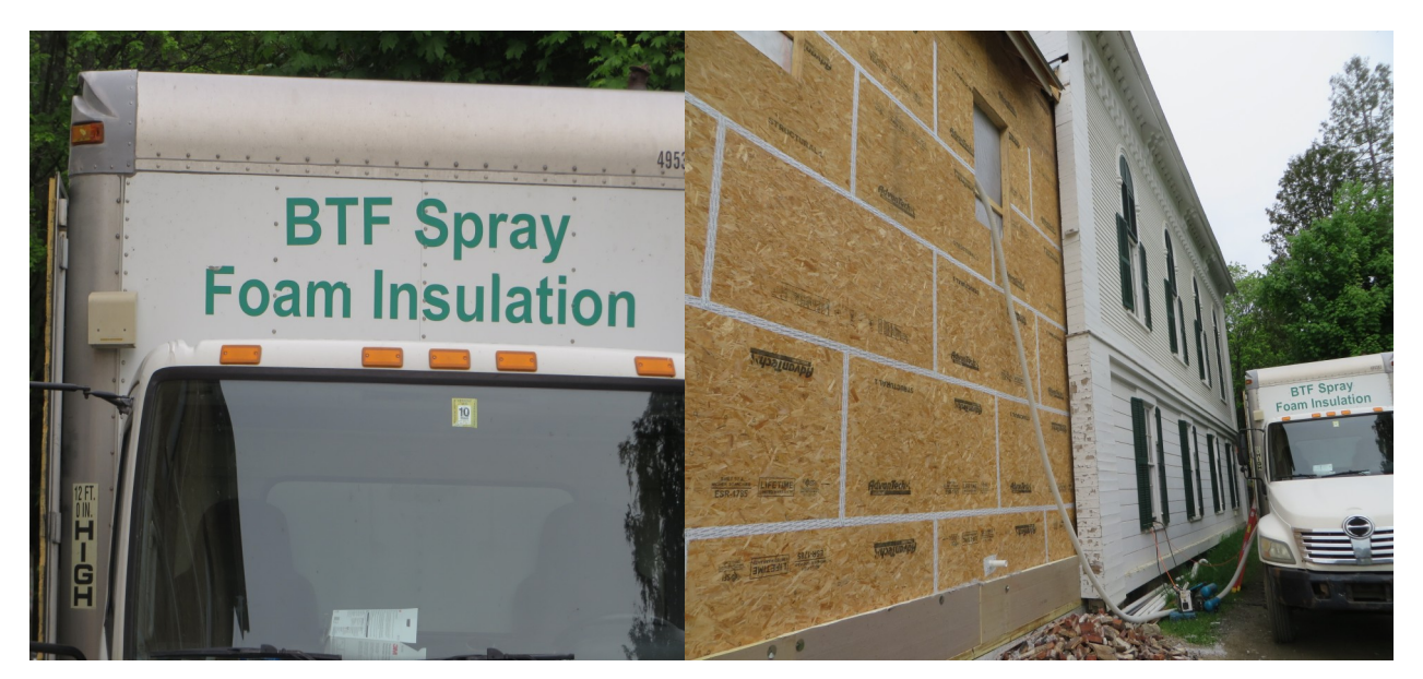
Insulation being blown in