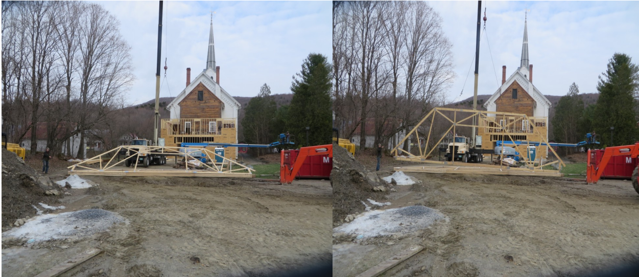
Up go the Roof Trusses