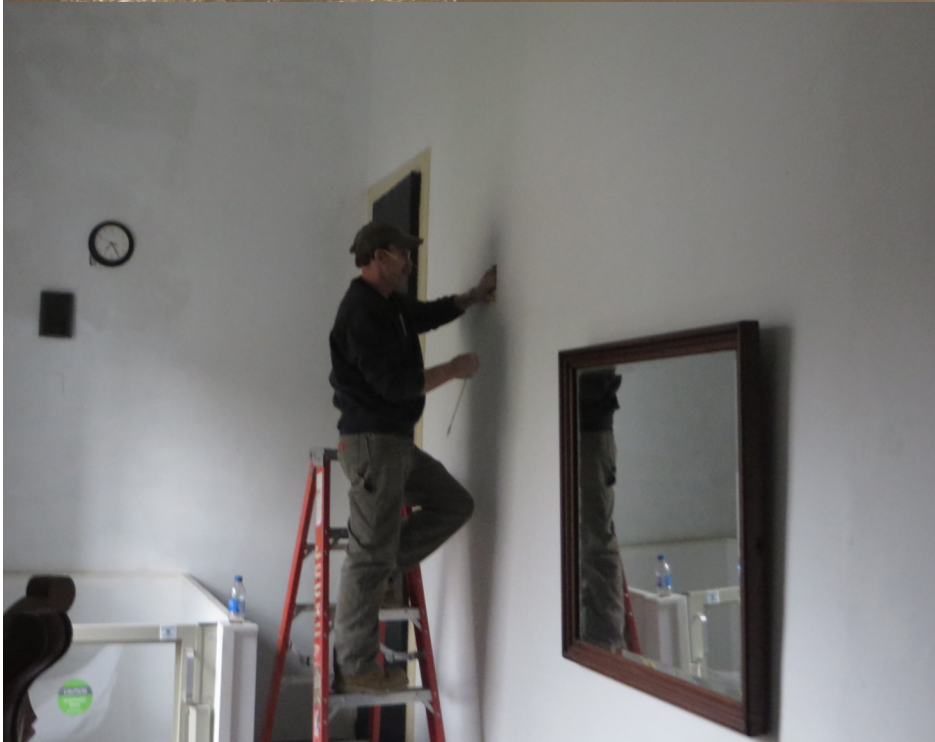
Nice new basement floor just poured and electrical work being done in the front hall